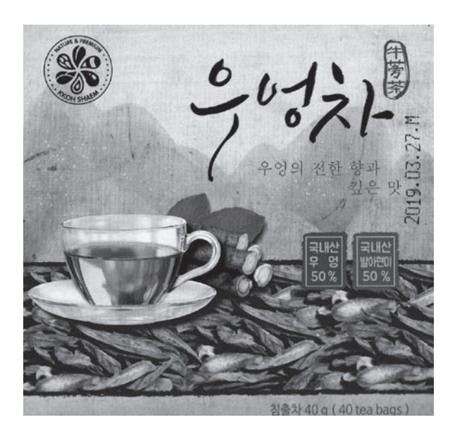
Figure 6. Burdock root tea bags box illustration.