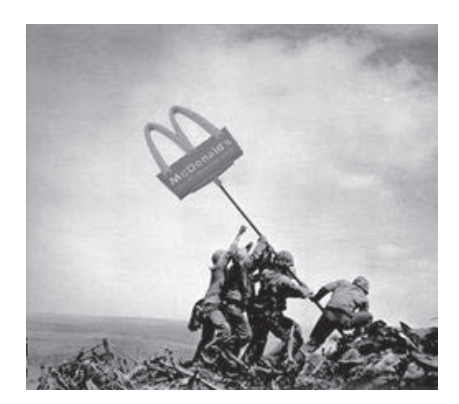
Figure 1. Raising the Golden Arches

Of course, the West is also guilty of using its influence for capitalistic gain as McDonald's® and CocaCola® permeate the entire planet. Advertising's role in the socialization of the world and the cultural implications for advertising was the topic covered in detail by researchers Jefferey K. Johnson and Carrie La Ferle in their writing of "Raising the Golden Arches". The authors correlate the fast food industry advertising campaign and its role in the socialization of the world has made the golden arches of McDonald's® a more recognizable symbol worldwide than the Christian cross (Okazaki, 2012). Figure 1 below provides the reader with a reference of the "Raising the Golden Arches" image.