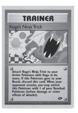
Figure 3. Pokemon trading card with and without manji character.

The perceived Nazi imagery was a heated issue as members of the Jewish community in the United States accused Nintendo of using the swastika for offensive purposes while lacking the cultural awareness that the swastika was merely the "manji" character symbolizing Buddhism (Fitzgerald, 1999).